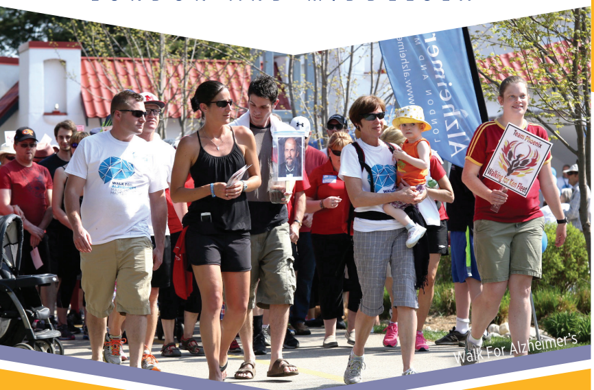
Walk For Alzheimer's