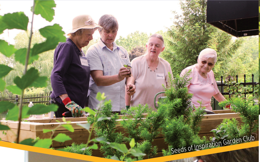
Seeds of Inspiration Garden Club