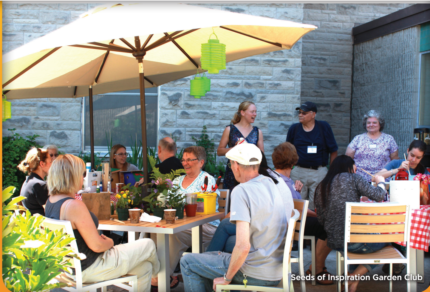
Seeds of Inspiration Garden Club